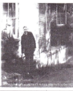
The Royal Oak as it appeared in 1936