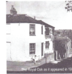
The Royal Oak as it appeared in 1936